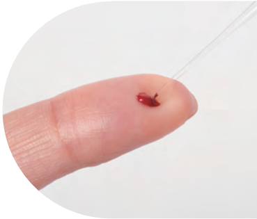
1. Sample Collection